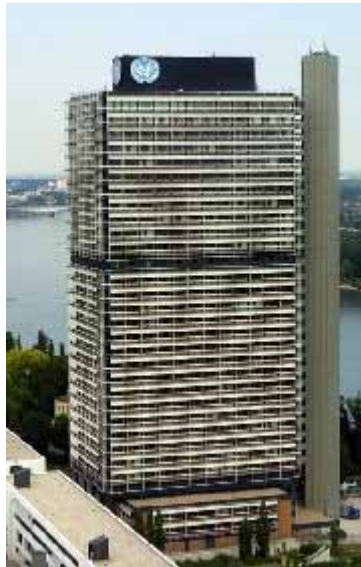
UN Campus Hermann-Ehlers-Str. 10 53113 Bonn, Germany 25th Floor

UNESCO's International Centre for Technical and Vocational Education and Training ("UNESCO-UNEVOC") is located as follows: